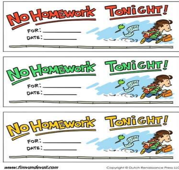
Fig.3: An example of homework pass.

There is no doubt that it is very hard job to keep the students motivated till the last minute. But the teachers used many different techniques to do so. All interviewed teachers use brain breaks between different tasks. For example, sometimes, they sang together, sometimes they asked funny questions mutually. Also, teachers worked with their student depending on their strength points. This means the teachers were applying multiple intelligences in teaching the one class by giving each student one task related to his\her strength point. Teacher 4, for instance, said that she sometimes had to stop and have discussion with the class about what was going on; sometimes she made individual meetings with students. So, she preferred to change her style for what the class responded to.