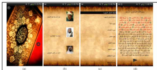
Fig. 2: The Qur'an Reciter Application GUI. (a) Welcome screen, (b) Reciter selection screen, (c) Chapter selection screen, (d) Text-to-sound synchronizing screen (recited words are highlighted in red)