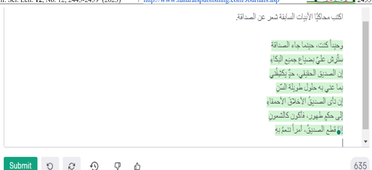
Fig. 6: The poem produced by ChatGPT4

This contradicts the finding of Kobis' study that humans may not differentiate between poetry generated by AI and poetry written by humans [8].