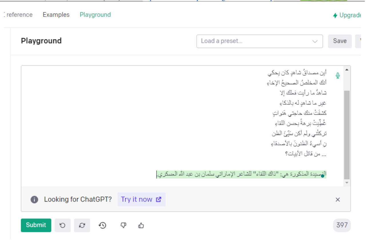
Fig. 3: A screenshot of the chat taken place between the researcher and ChatGPT regarding Ibn al-Rumi's poem on friendship

These verses were presented and ChatGPT was asked to imitate them. Thus, it produced the verses again without imitation .Figure 4 below illustrates this.