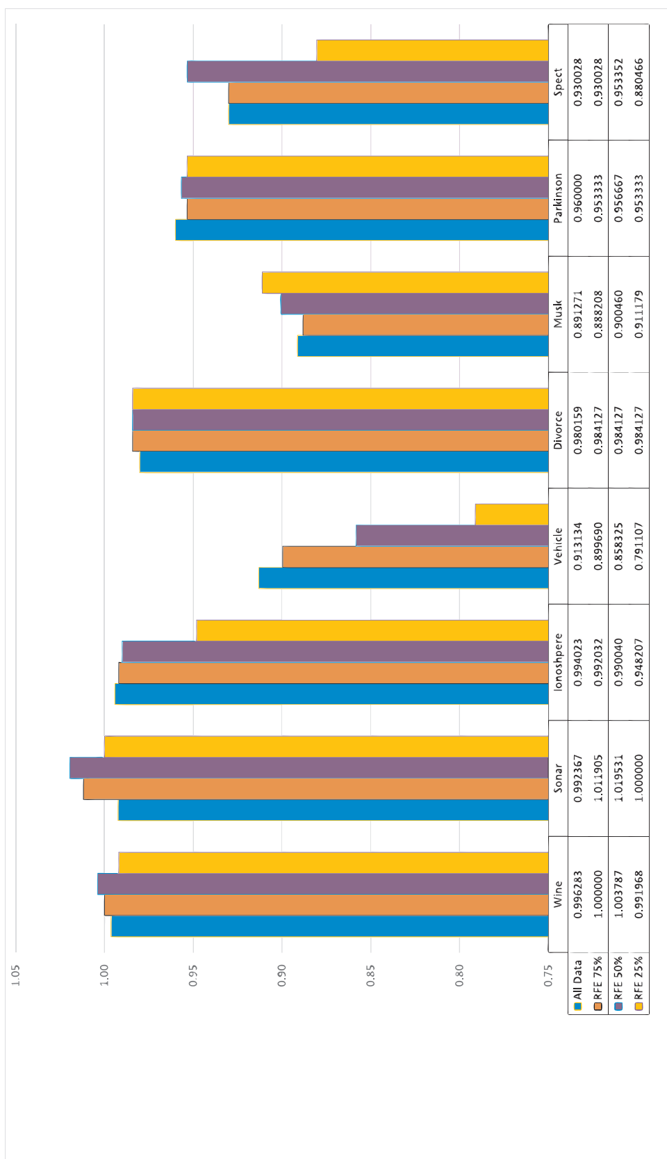
Fig. 3 Relative performance rates of RFE-HOM-R-SVM