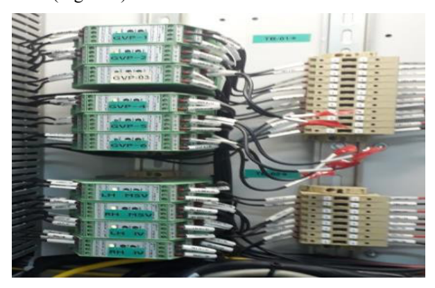
Fig. 8: AC/DC Converter

Second, we must replace the LVDT with a new type that has a DC-voltage output. This will remove the noise, and we also won't need an AC/DC converter (Figure 8).