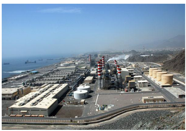
Fig. 3: Top view of Stage III

Stage III consists of four steam turbines and a control system operated by Emerson "Ovation," which runs regularly, depending on the overhaul, and shuts down in winter, as shown in Figure 3. Stage III outputs a maximum of 532 MW. Linked with substation no 1, it is connected to Jeddah LDC, which controls the output, as per the frequency calculated by the SCADA/AGC control system (Table 3) [1].