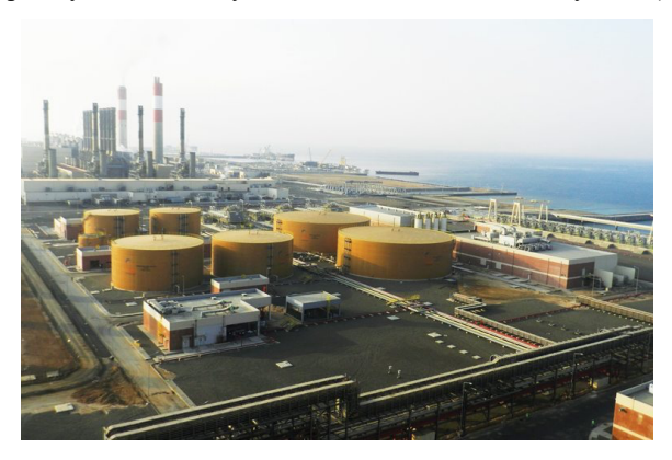
Fig. 2: Location View of Stage II

Stage II consists of eight ABB gas turbines and a Heat Recovery Steam Generator (HRSG). Each four gas turbines and the HRSG connects to a steam turbine as a combined-cycle unit under a control system operated by ABB "Symphony plus," which runs depending on the load required and the overhaul schedule and shuts down in winter. Stage II generates a maximum of 696 MW (illustrated in Figure 2). It is linked with substation 1 and connected to Jeddah LDC, which can control the output as per the frequency calculated by the SCADA/AGC control system (Table 2) [2].