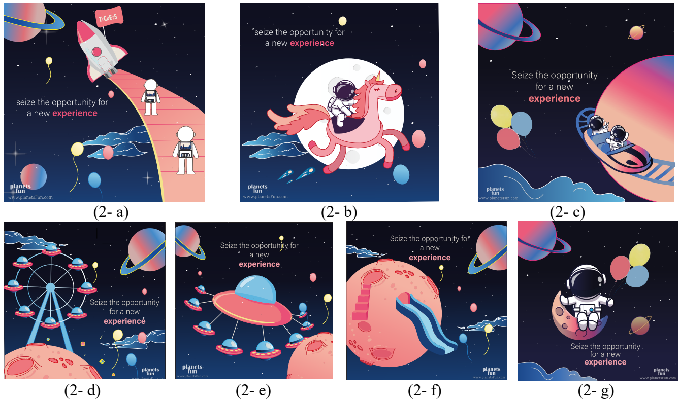
Fig. 2: advertisements designed for “Planets Fun.”

In Fig (2- a) the ticket-booth is substituted with a spaceship. Fig (2- b) wandering in the space is combined with riding a unicorn. Fig (2- c) an attempt to apply adapt technique as train is orbiting around a planet to demonstrate the sense of excitement and adventure. Fig (2-d) an attempt to apply “modify / magnify” technique, as a UFO was used in the Ferris wheel also, Ferris wheel is magnified compared to the size of the planet. Fig (2-e) UFO is put to another use as the issued twice in the swing-around ride; in both the rotating center and the passengers’ cars. Fig (2-f) an attempt to apply eliminate technique. Fig (2-g) In the last advertisement; the students attempted to apply the “reverse” technique as the journey has ended and it is time to go back home; the child astronaut is riding a moon and descending to earth using a few balloons.