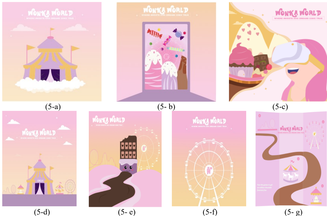
Fig. 5: advertisements designed for “Wonka World”

Advertisements designed for “Wonka World” event; the idea is based on the “Willy Wonka and the Chocolate Factory” film; it represents a city full of sweets and candy, the campaign uses the advertising phrase “Where sweets and dreams come true”.