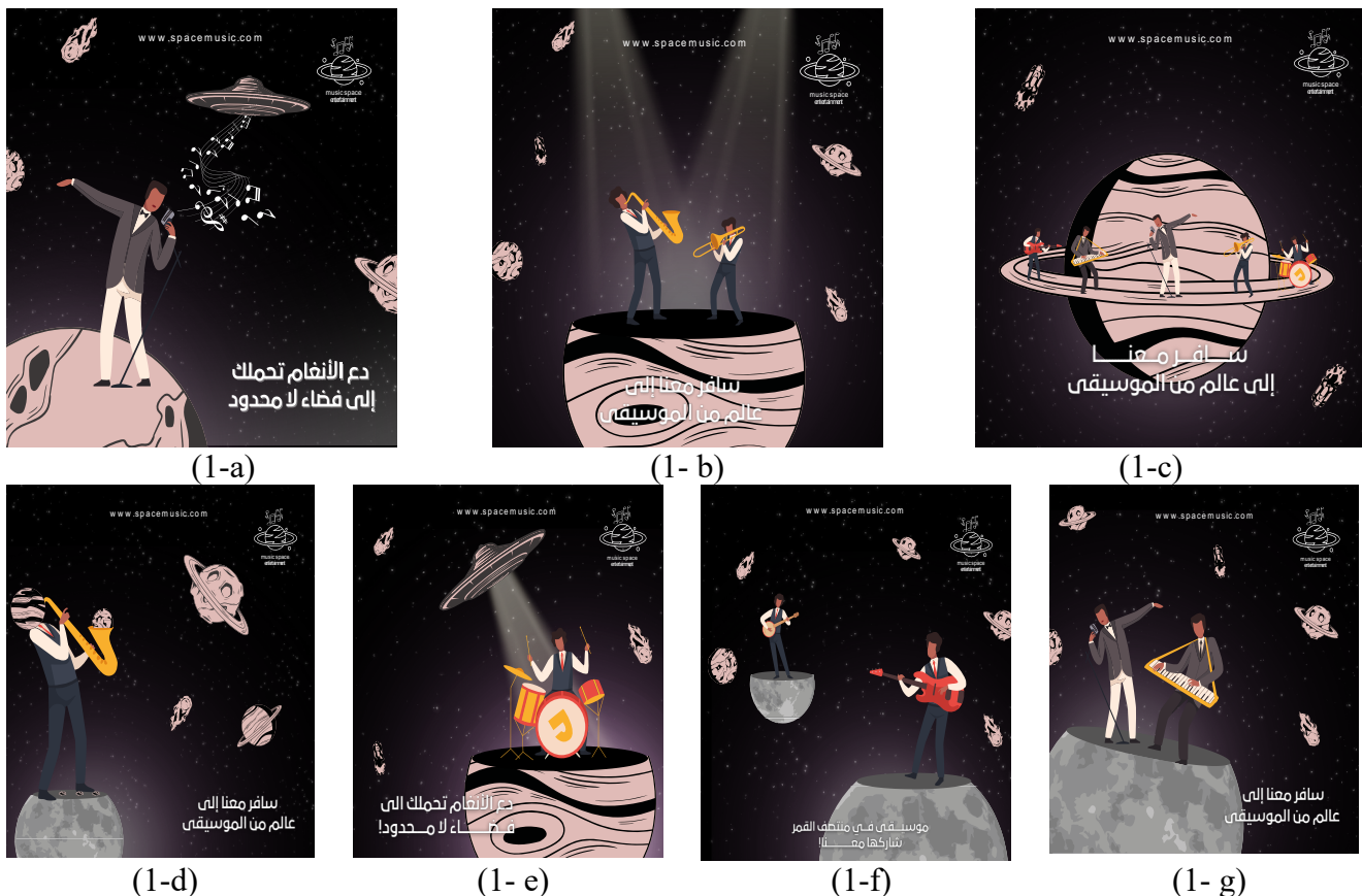
Fig. 1: advertisements designed for “music space.”

Advertisements designed for “The music space stage”; a unique idea about holding a musical event in space. This campaign aims to attract audiences to the space stage where the “Chilly Gonzales” music fills up their surroundings. Several advertising phrases are used in this campaign, such as; Travel with us to a world of music, Music at the center of the moon, let the music carry you to an unlimited space.