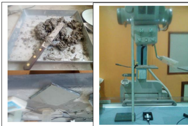
Fig. 2: Cement water mix, mold and experiment layout

The apparatus was setup at the centre of the x-ray room so