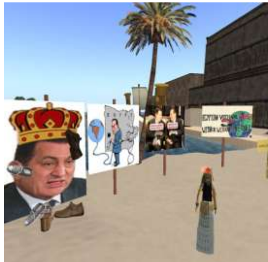
Fig. 2. People protesting on Second Life [21].

People not only used available communication tools, they have also created their own personal blogs to support the revolution. These blogs offer a place where these ordinary people were able to express their opinions and share their thoughts. Bloggers became “citizen journalists.” They gathered and spread news to others through their blogs. They were active during the elections were they documented what was happening by taking photos and videos ( Countries under surveillance 2011 ). Some of these blogs are: Egyptian Chronicles , the Egypt blog , and FREE BLOG for FREE PEOPLE.