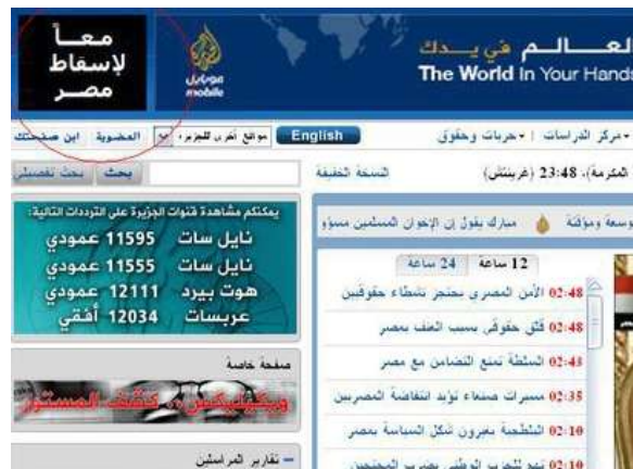
Fig. 3. Al-Jazeera website hacked [6]

One of the major news channels, Al-Jazeera, was attacked in two different ways. Its website was hacked by opponents of the revolution and defaced. They posted an ad on the Aljazeera website that said “Together to overthrow Egypt” ( The Hacker News 2011). As shown in Figure 3, they changed the logo on the top left corner. They were trying to damage Aljazeera’s reputation. Its TV channel signal was being interrupted in many countries in the Arab region to prevent them from broadcasting news about the anti-government demonstrators.