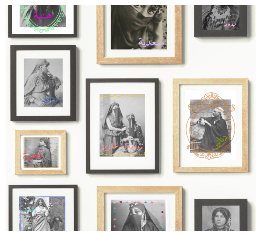
Fig. 5: Hafez, D. (2019) My Name Is [digital multimedia], Available at <u>https://womenofegyptmag.com/2020/12/22/dina-hafez-decolonizing-heritage-through-a-feminist-lens-one-bead-at-a-time/</u> (Accessed on 14th August 2022).

In (Figure 5) My Name Is , Hafez lends names to anonymous women in vintage oriental pictures and old photos. She aims to give them a life story to include them in an unwritten history of Egypt.