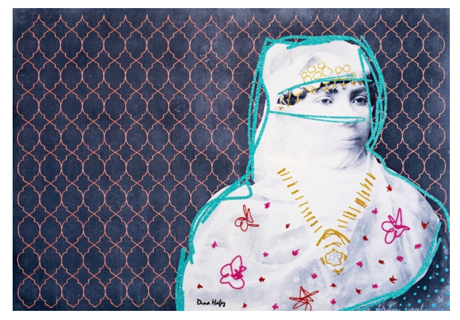
Fig. 6: Hafez, D. (2019) Unfamiliar Faces -Yasmak Woman [Multimedia], Available at https://womenofegyptmag.com/2020/12/22/dina-hafez-decolonizing-heritage-through-a-feminist-lens-one-bead-at-a-time/ (Accessed on 14th August 2022

Hafez's artwork "Unfamiliar Faces - Yasmak Woman" integrates digital media with traditional beading and crafts, as depicted in Figure 6. The piece portrays a woman veiled in white, a symbol of tradition, yet deviates from conventionality by incorporating vibrant designs onto the veil. Unlike the typical opaque veil, hers reveals her mouth, suggesting a departure from silence toward vocal expression. Her gaze extends beyond the viewer, indicating a forward-looking perspective. Additionally, the backdrop features traditional golden embroidery reminiscent of confinement, evoking associations with prison camp wires or gilded cages. Hafez's artistic approach intertwines Egypt's rich history of crafts with contemporary digital photography, aiming to reignite women's appreciation for traditional techniques while fostering an interest in digital art.