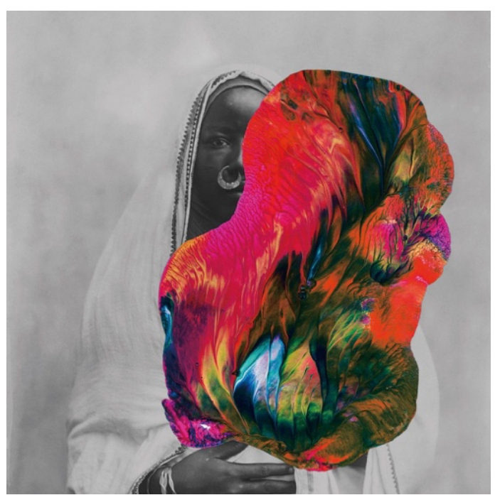
Fig. 2: Beya Khalifa (2019) Scare Tissue [digital multimedia], Available at <u>https://scoopempire.com/this-egyptian-digital-collage-artist-will-blow-your-mind-with-her-work//</u>, (Accessed on August 20th, 2022).

Khalifa, through her surreal collages, creates fantastical surreal gateways into old Orientalist photographs of Egyptian women to re-write the colonial narrative for these women [28]. In Scare Tissue (Figure 2), using digital photography, Beya takes one of the old colonial photographs and covers it with a surrealist entanglement of bright colors that creates the illusion of textured scare. The woman's face is only partially covered by a colorful scar, leaving the other half to display a nose - ring that brands her as "different" or "exotic". One eye is visible from behind the oversized scar, which seems to shield her from the prying eyes of foreign viewers. At the bottom of the composition, her hand appears to bear the burden of the scar, which may symbolize the hardships endured by local tribes and nations during colonial times. The artist, Khalifa, may also be alluding to the way women are often regarded in Egyptian society today, where they are sometimes criticized and judged for not conforming to traditional gender-based cultural roles.