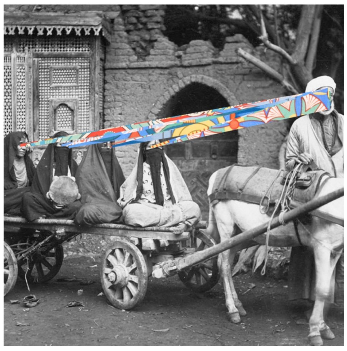
Fig. 3: Beya Khalifa (2019) Oppression III [digital multimedia], Available at <u>https://scoopempire.com/this-egyptian-digital-collage-artist-will-blow-your-mind-with-her-work//</u>, (Accessed on 20th August, 2022).

Since its inception, Egyptian feminists have recognized the significance of gaining agency in the private sphere to achieve true empowerment in the public sphere. They understood that personal status laws, particularly regarding polygamy and divorce, remain deeply entrenched in patriarchal norms, persisting to the present day. Lack of real power in the private sphere often leads to a failure to win true agency and power in the public sphere [29].