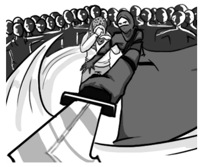
Fig. 7: Mohammed, D. (2013) Qahara [digital media], Available at <u>https://foreignpolicy.com/2013/12/11/egypts-women-fight-back/</u> (Accessed on 1<sup>st</sup>, Sept 2022).

In (Figure 7) Mohamed objects to incidents where the victim becomes the culprit often blamed for her demise because she was out of her house at what is culturally considered a late hour for a respectable woman, or because of her supposedly inappropriate attire which she is told has probably instigated the attack in the first place.