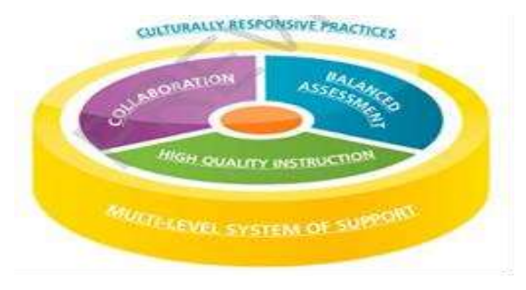
Fig.1: Wisconsin's Response to Intervention Framework.

Response to Intervention model provides a systems framework for integrated collaboration, instruction, and assessments that better meet the needs of all students<sup>(4)</sup>. Special education and English Language teachers along with psychologists and other support specialists have a close connection to classrooms teachers to increase communication and the